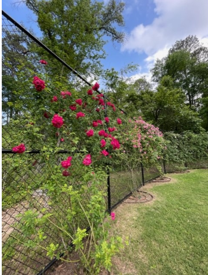
Wall of Ramblers at the ARS Garden

All in all, we had a wonderful time and I encourage each of you to visit the ARS Headquarters and Gardens, maybe when it’s not that hot.