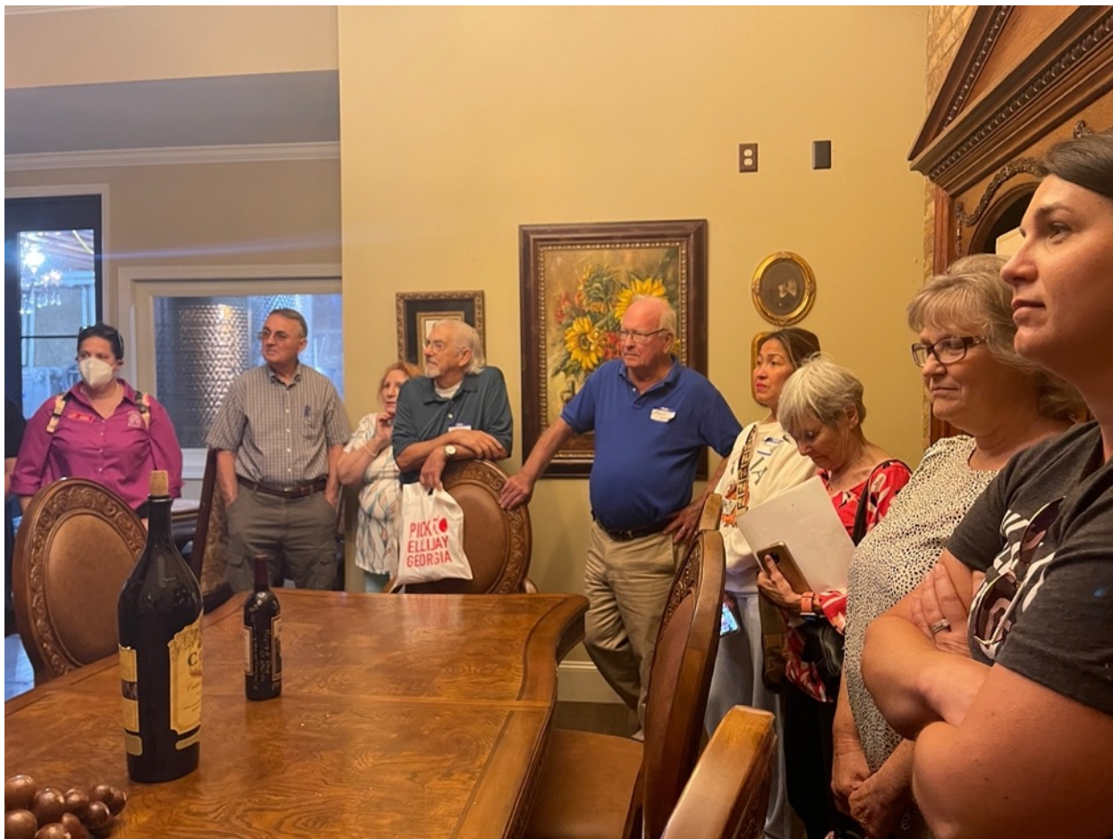
Rosarians on the Wine Tour

strained and put into vats. Depending on the type of wine they are either bottled or put into barrels for aging.