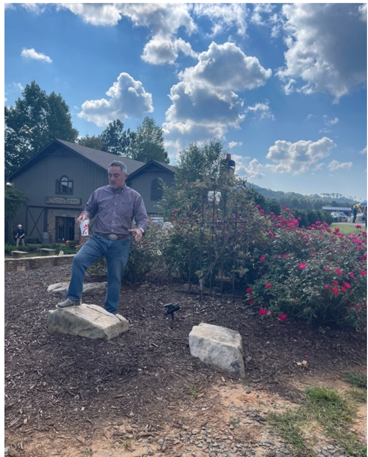
The Winery Tour with the original grapevine in the background

making. It was his grand-daughter who finally realized his dream and started the winery in Georgia. There is even a vine of the original grapevine on the property. On the tour, we learned that growing grapes is a lot like growing roses. The main concerns in this area being late Spring Frosts. We did have one this past Spring in North Georgia and Chateau Meichtry lost about 25% of their crop. The other concerns are pests and diseases. Some wineries plant a rose bush at the end of a row of vines as roses will show disease and pest pressure before the vines. Of course, grape vines have some specific issues and in North Georgia, they not only have to deal with birds, deer but