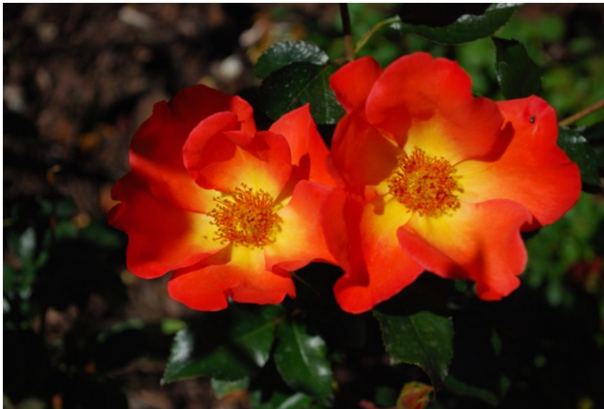
Playboy taken October 23 rd . The sun from the east is shining direct on the rose making it glow.