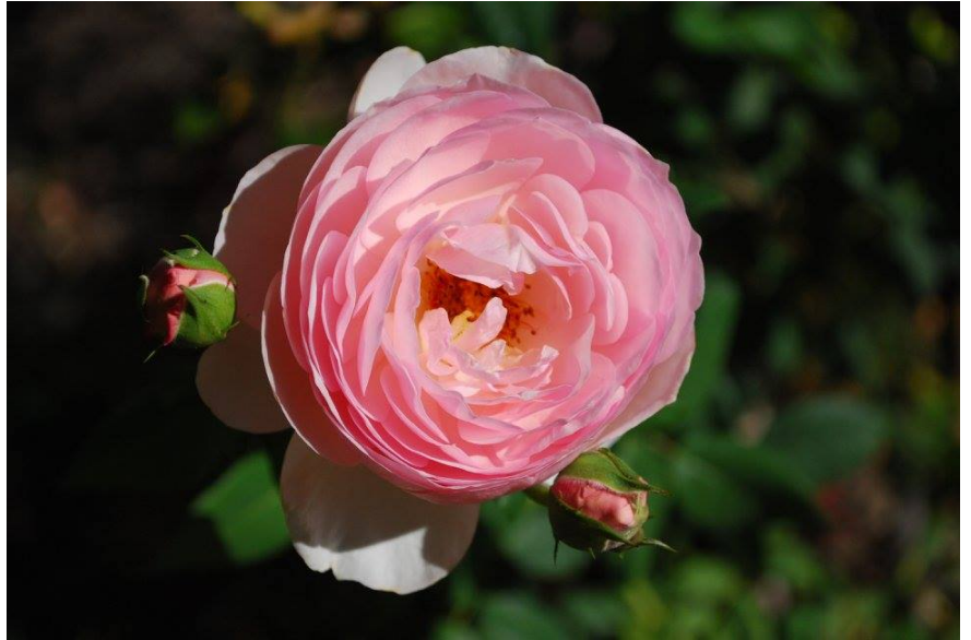
Heritage, taken October 23 rd