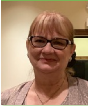
By Sandy Dixon