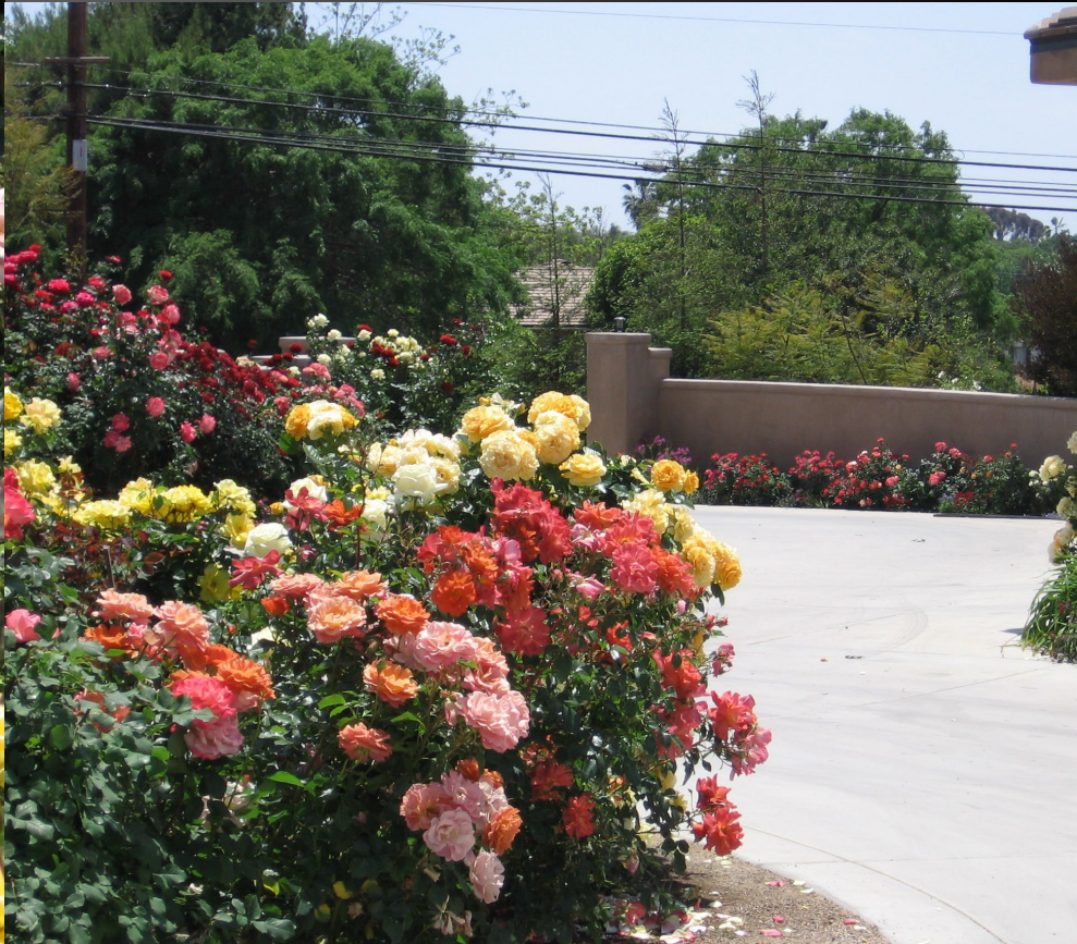
Tuscan Sun, Laura Bush, Julia Child