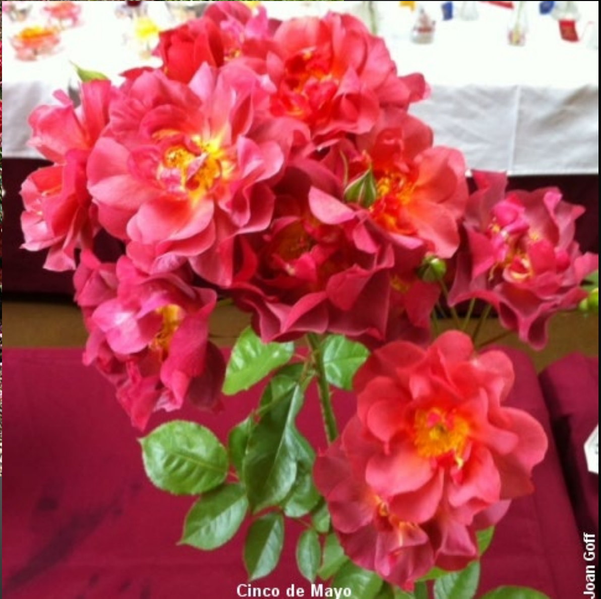
Cinco de Mayo