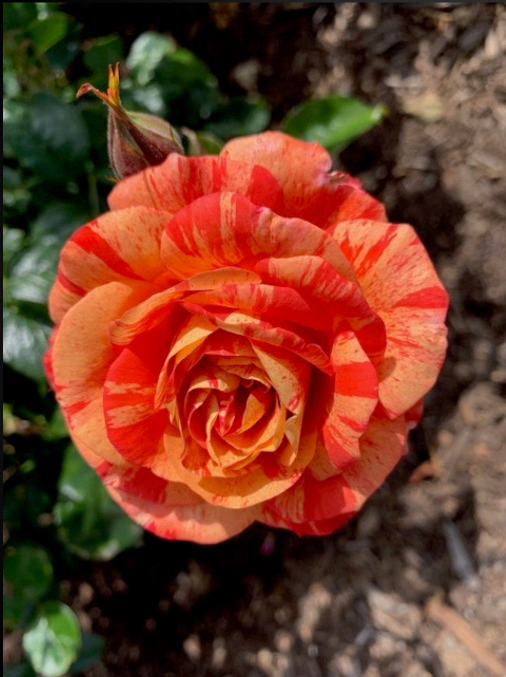
Frida Kahlo – striped, sprays and single stem