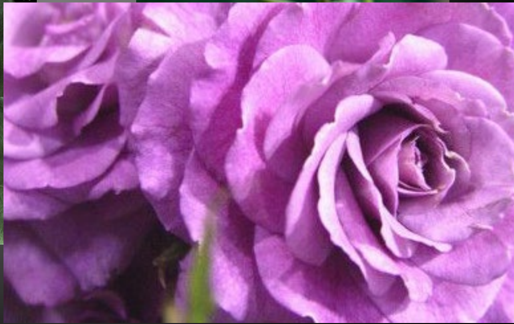
Ebb Tide and Sweet Intoxication