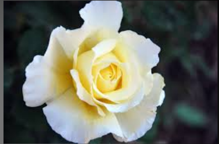
White Licorice Fragrant Cropper One to a stem