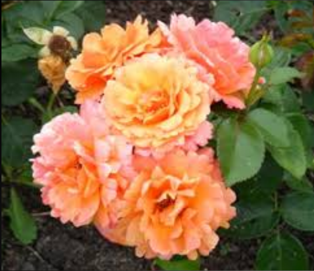
Easy Does It