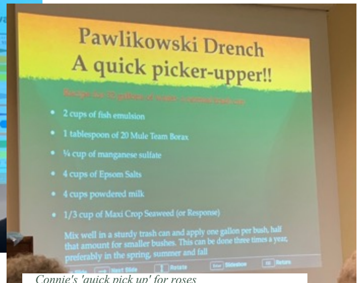
Connie's 'quick pick up' for roses