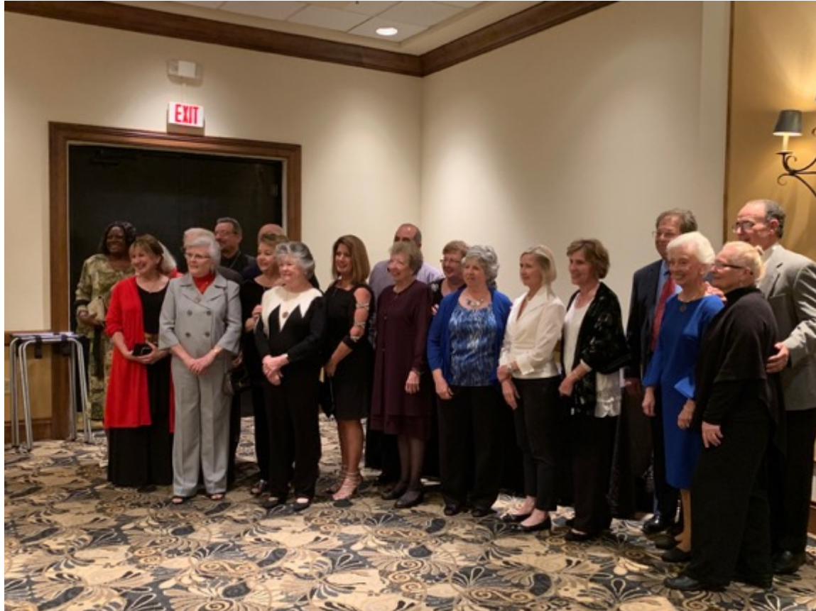
The Tampa Rose Society Team