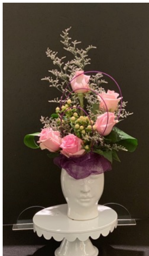
An Arrangement from our Seminar