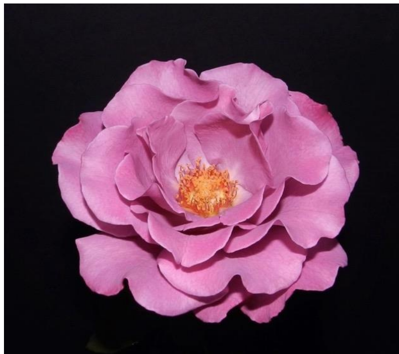
Angel Face

Order Your 2019 Roses Wall Calendar Today!