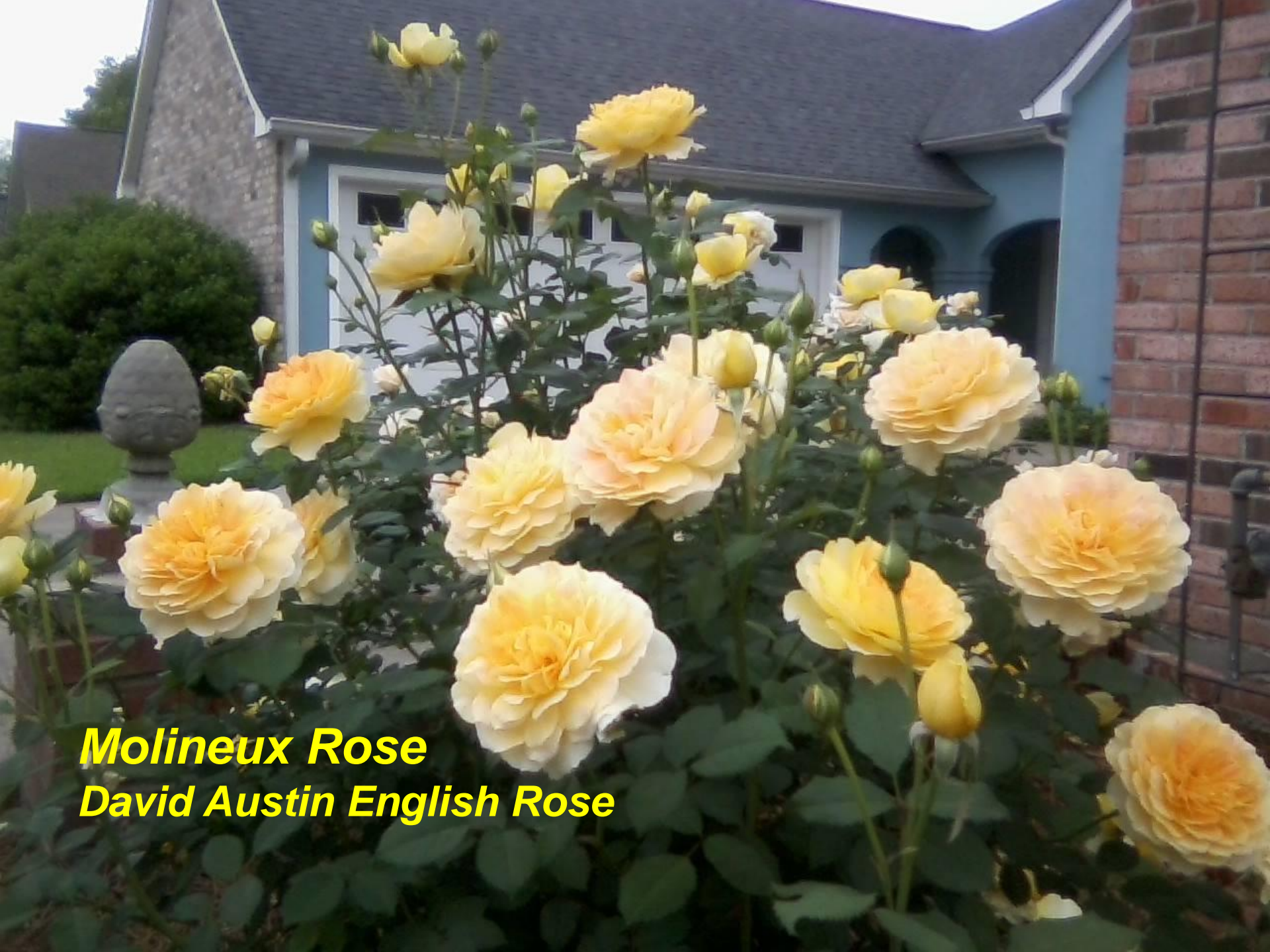
Molineux Rose David Austin English Rose