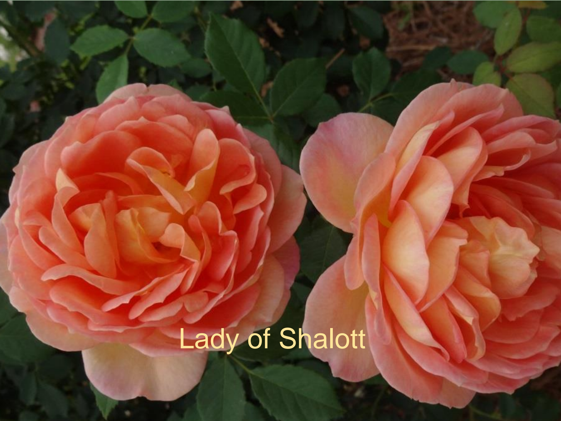
Lady of Shalott