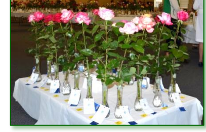
Hybrid teas await further judging at the South Metro Rose Show.

Have a good summer and I hope to see you all soon.