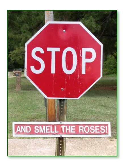
My favorite sign at the American Rose Center. It's summer, enjoy the roses!