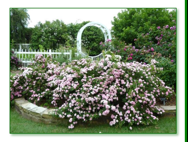
Rosa "Petite Pink Scotch", Birmingham Botanical Gardens

The focus of the Board's attention is to develop methods to increase ARS membership. It was reported that we had 8,398 members nationally and only 770 Deep South District Members. These disturbing statistics show a continuing decline in our membership in the last few years. I was especially distressed to learn that for our 25 active rose