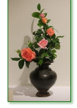
Arrangement from the Gainesville Rose Show.

When I did start to exhibit, I became a better rose grower. I didn't win the Queen of Show, but I did win a few blue ribbons, and learned which classes my puny roses had a chance in. You know, like fully open bloom, most fragrant, rose in a bowl, or any class that didn't require stems or foliage. Lo and behold, I won a few times! Most of the time I didn't win any prizes. OK, I'll use the "L" word. I lost. I think that losing graciously builds character and makes you stronger.