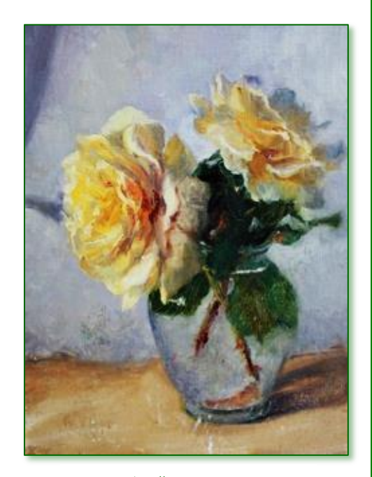
"Yellow Roses" Oil 9" X 12" Painting by Hope Reis