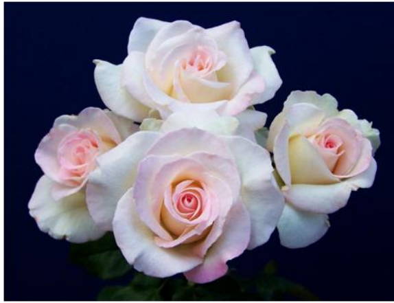
Cajun Moon - 2011 Best in Show - by Cindy Dale