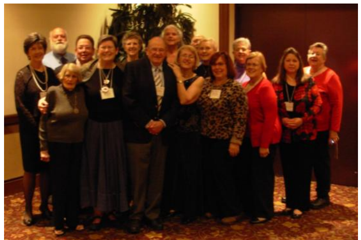
The Atlanta area attendees at MWM 2012

I hope to see a lot of you at our Judging School this summer.