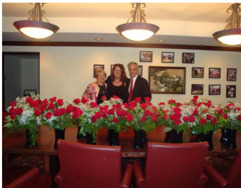
A room full of arrangements for the MWM banquet in January

Have a wonderful spring and success in your arranging endeavors. Remember beautiful arrangements complement any occasion, not just rose shows.