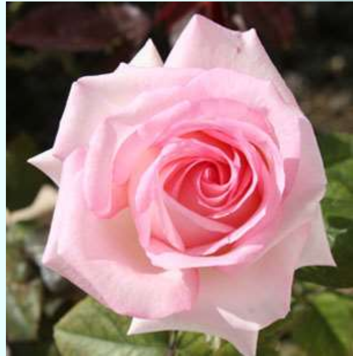
Mavrik Pink Blend