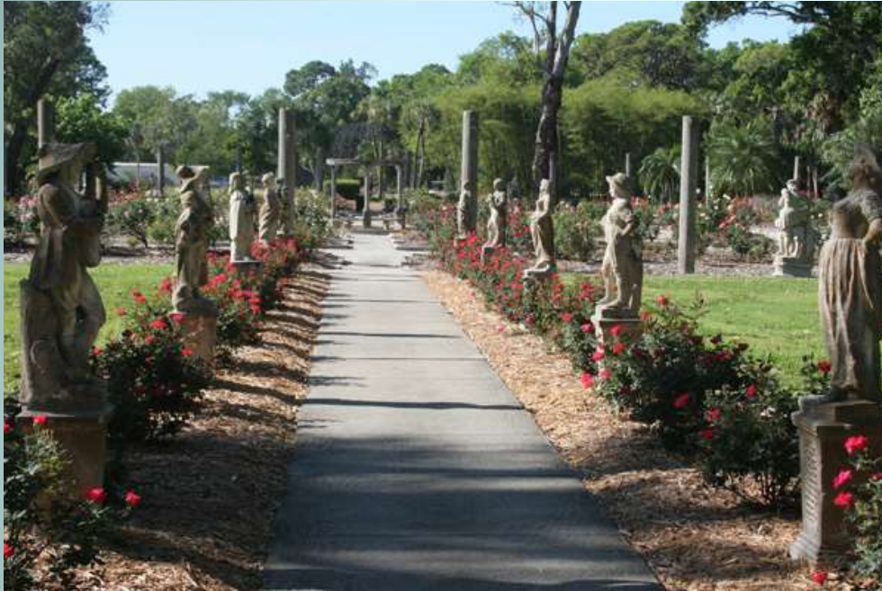
Beautiful Knockout Rose Path at Mable Ringling Gardens