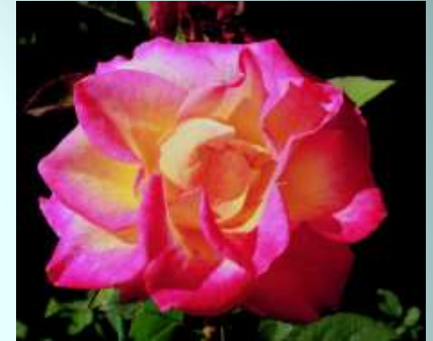
Brandy - Hey Jack - Perfect Moment