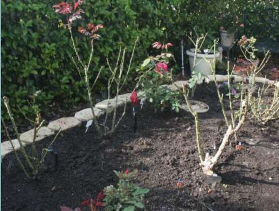
Post pruning in late February