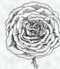
Old Garden Rose