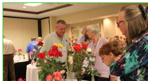
Visitors admire the roses at the show.