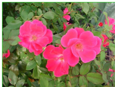
Above: 'Knock Out' the rose Below: 'Knock Out' the bush