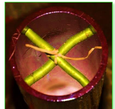
So that's how they do that! – a kubari

It is traditional for a Mini National to honor a hybridizer of note who