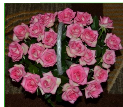
A basket of ‘Joy’ from the rose show.