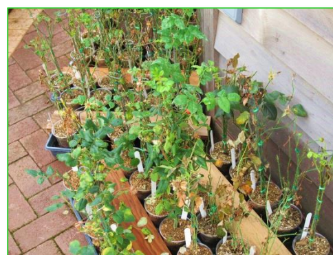
Radler's "boot camp for roses"