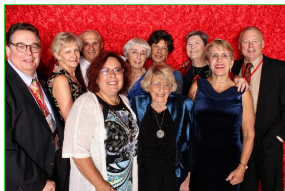
Just a few of the DSD attendees.