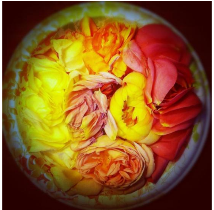
“PETALS ON A PLATE”

We believe this change in concept for the Bulletin will expand our reach to both ARS members who do not participate in local societies and to local society members who have not participated in the district activities. The content of the Bulletin will provide useful information for all rosarians in the Deep South District. This is the primary reason for our change.